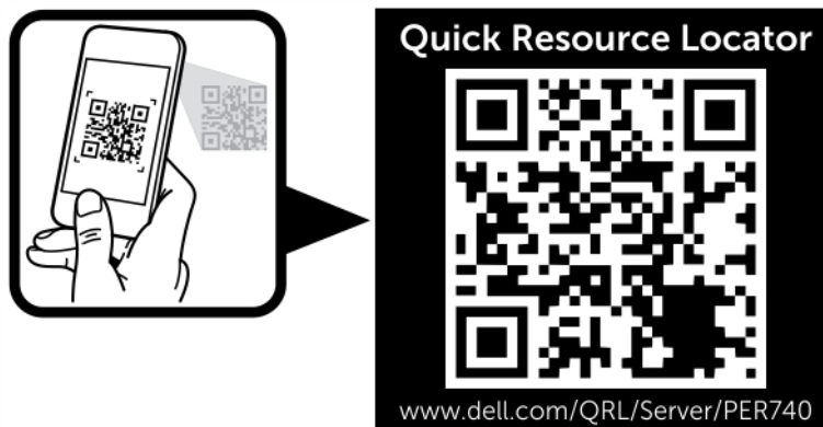
Figure 2. Quick Resource Locator for PowerEdge R740 and R740xd systems